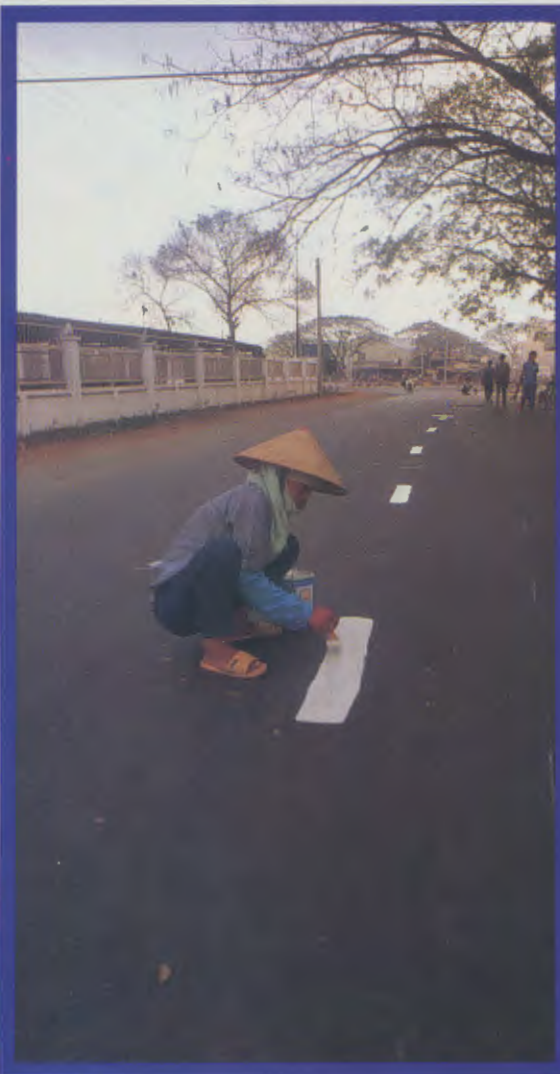
The road to prosperity isn't always a straight line. Lanes make a personal appearance outside Tan Son Nhat airport.