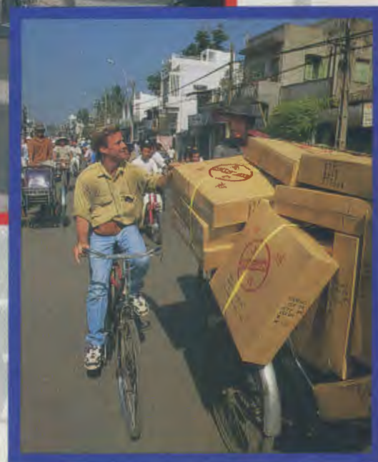
Cardboard factory on wheels gets assist from our man in HCM. Boxman's overloaded cyclo is part of massive incursion of products from Taiwan, Japan and Hong Kong.