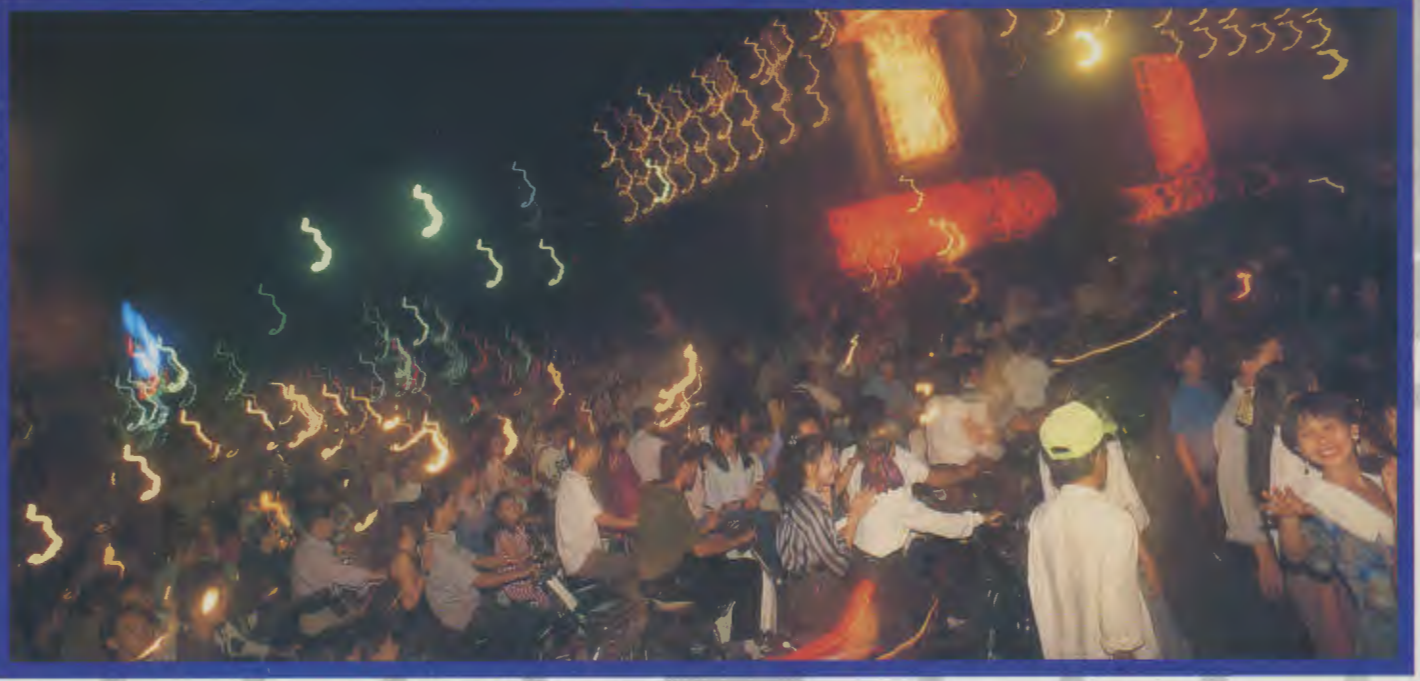
Cruisers stage mass drive-ins outside Rex in search of non-existent mall shops.