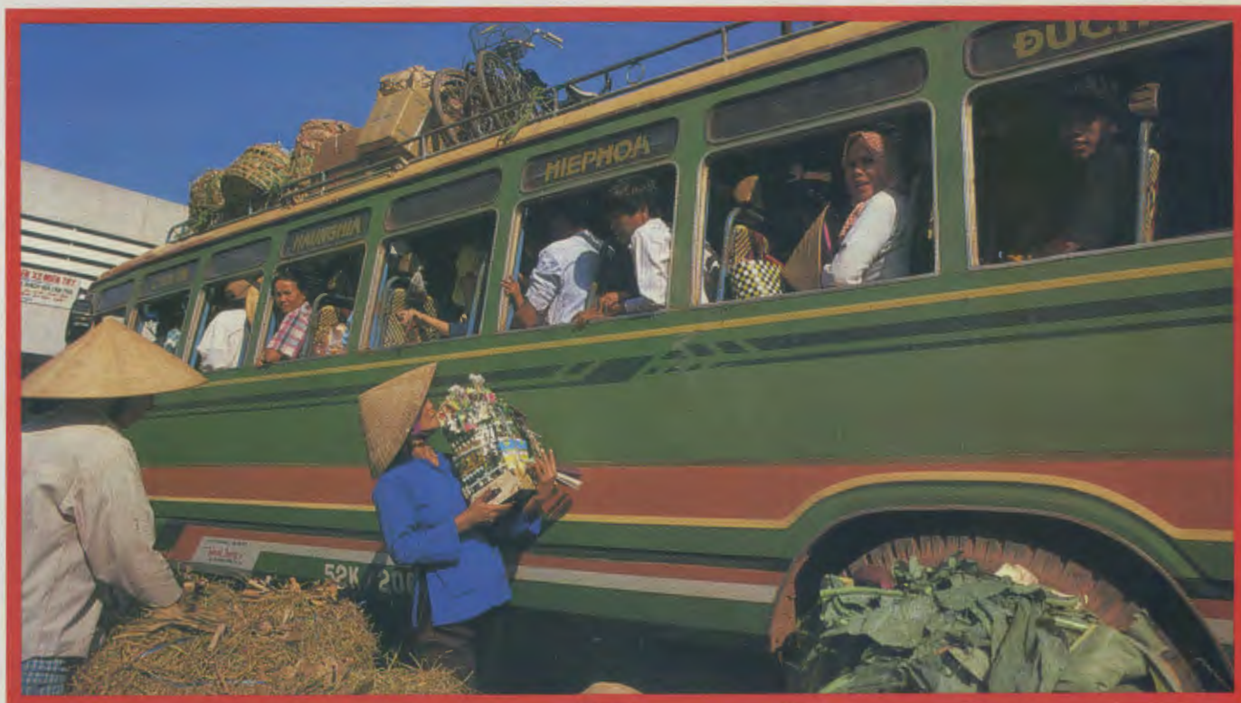
Vendor works captive audience at Cholon bus station.

H o Chi Minh City wears its best face at sunrise. The stained, granular buildings are porous sponges for the tangerine shafts of new sunlight; the horizontal beams turn the ashen statues of the city's roundabouts into dark teal. Shadows are long and everything seems very low to the ground. The streets are packed with motorbikes, which easily outnumber bicycles and even the trademark cyclos , the human-powered bicycle carriages that operate as taxis throughout Vietnam. Japanese motorbike manufacturers like Suzuki and Honda must be licking their chops at the potential offered by a market of 71 million motorcycle-crazed Vietnamese. On the way up the modern convenience totem pole, cars are not a factor here—yet. Instead, families of five are sandwiched onto a single moped, kids swallowed up in a tangle of big brothers' and mothers' legs and bags.