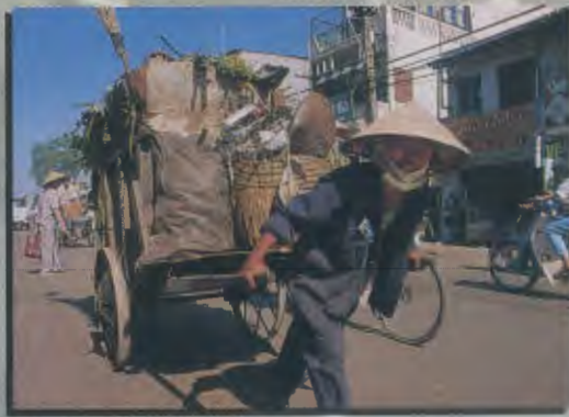
Above: City worker drives fuel-efficient vehicle.