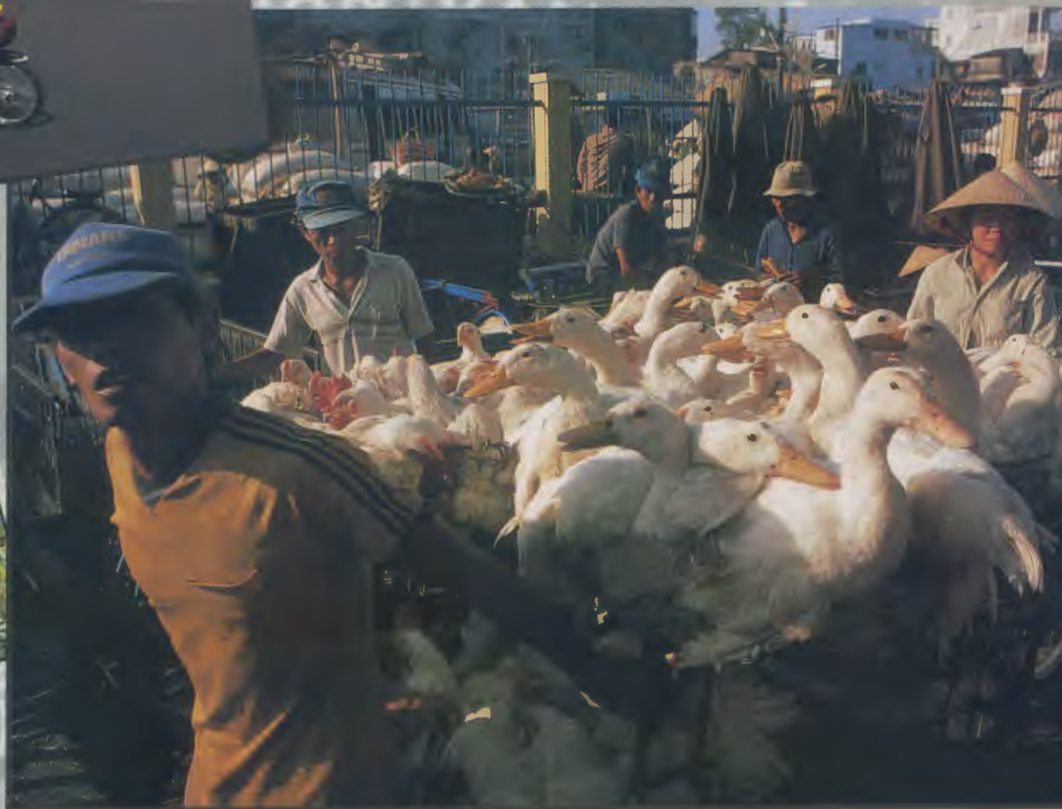
Birdman of Ho Chi Minh flocks to market with reluctant passengers.